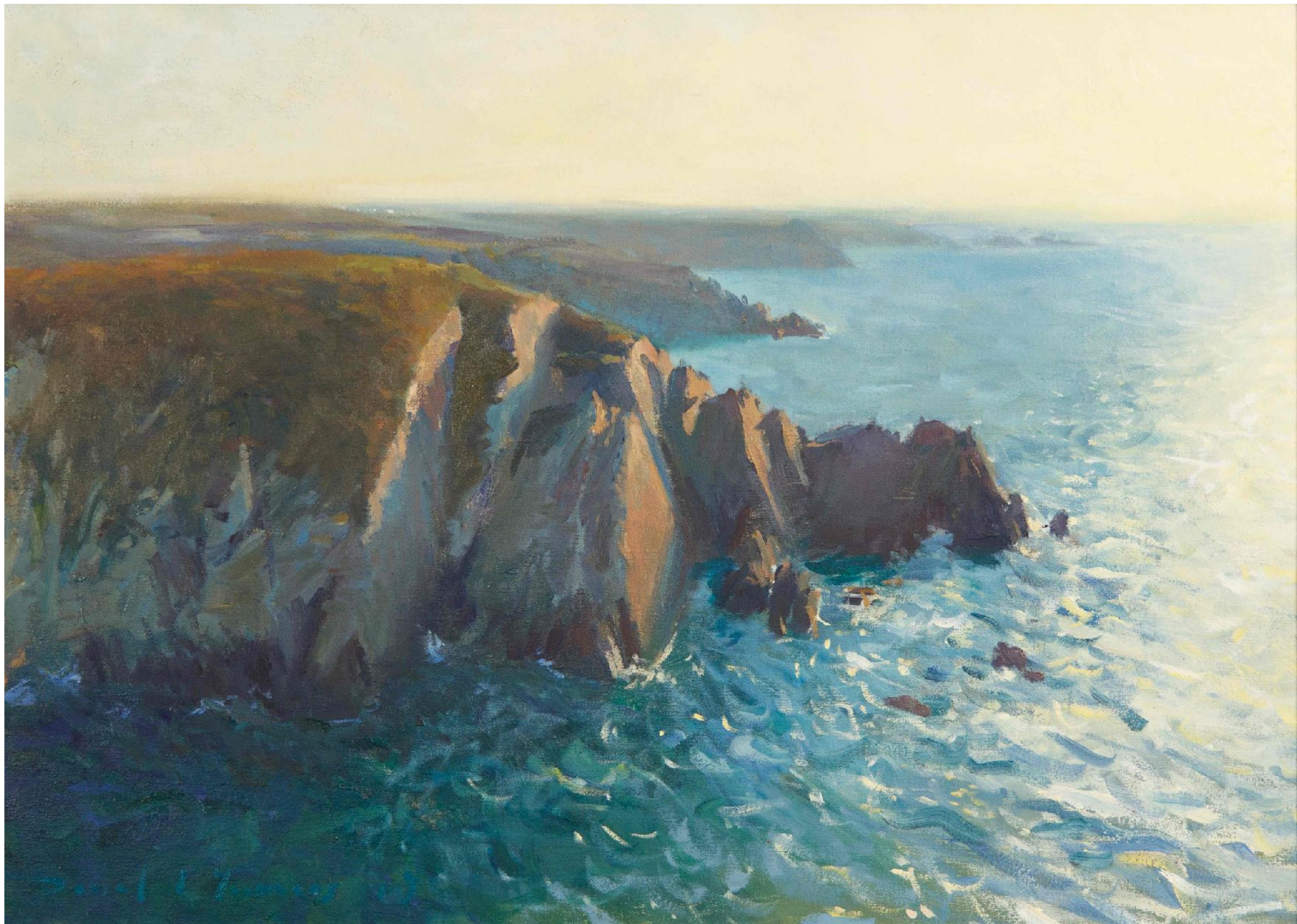
The Sound of the Sea Below | Oil on canvas | 75x50cm