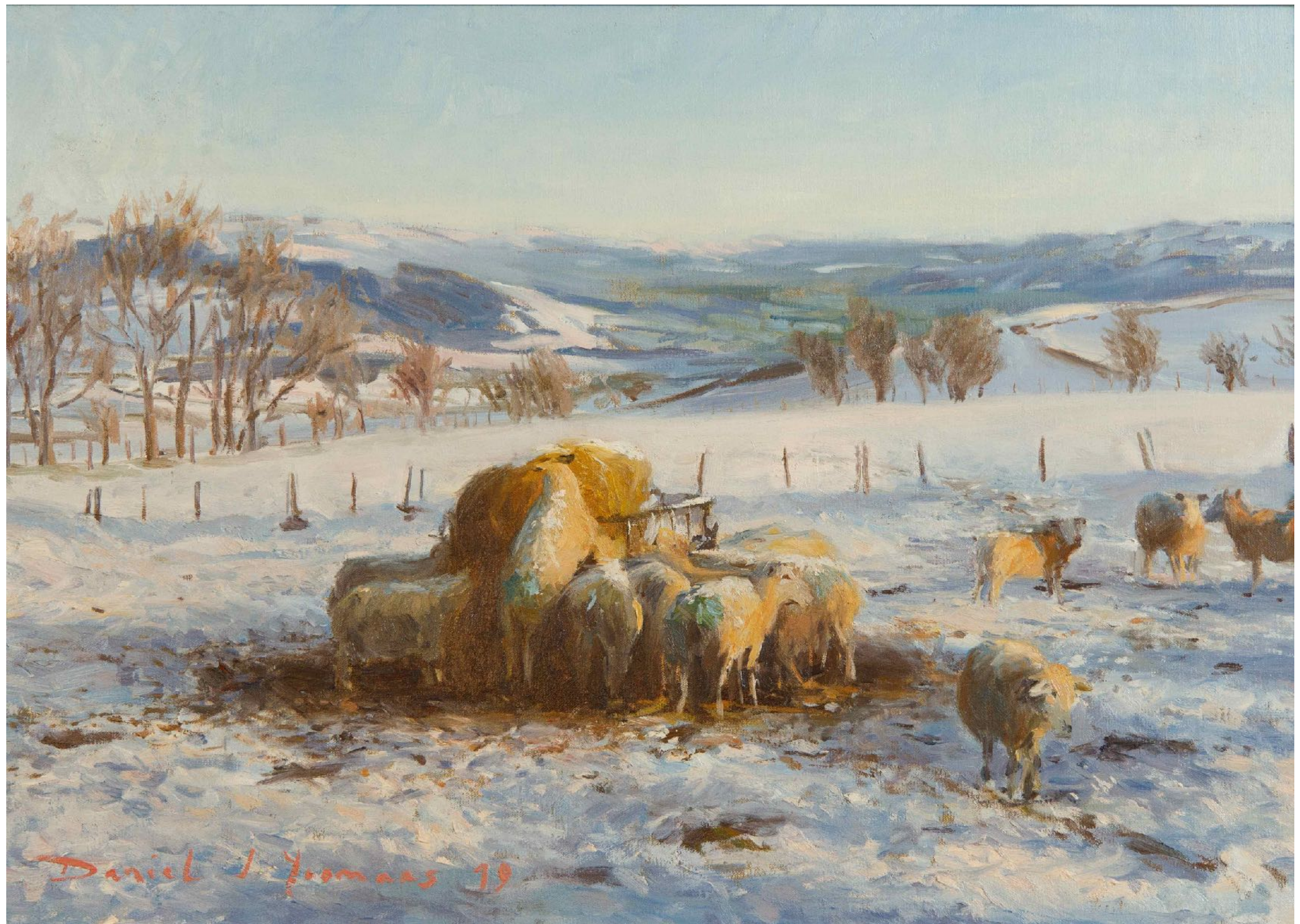
The first snowfall | Oil on canvas | 70x50cm