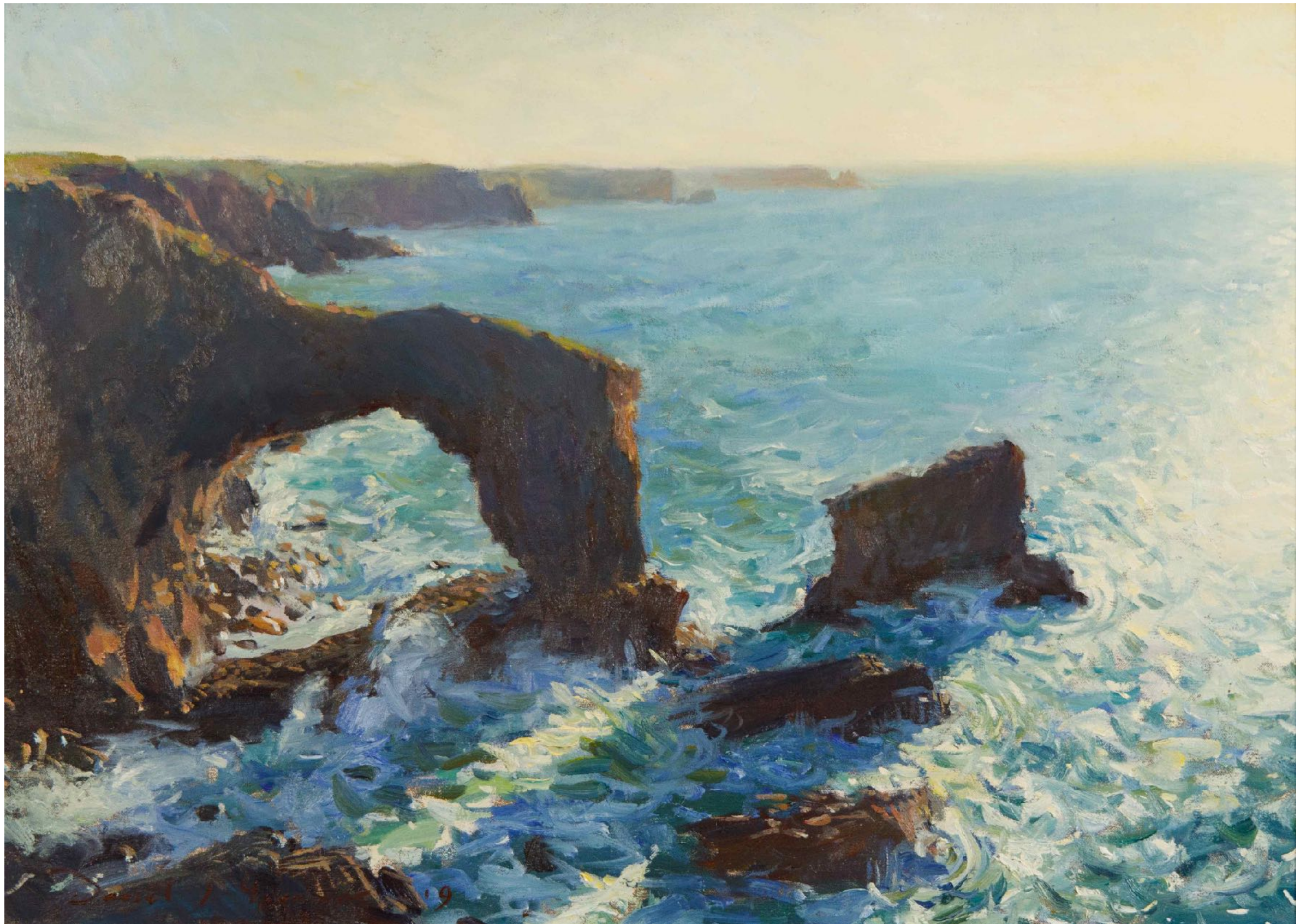
The Green Bridge of Wales | Oil on canvas | 50x75cm