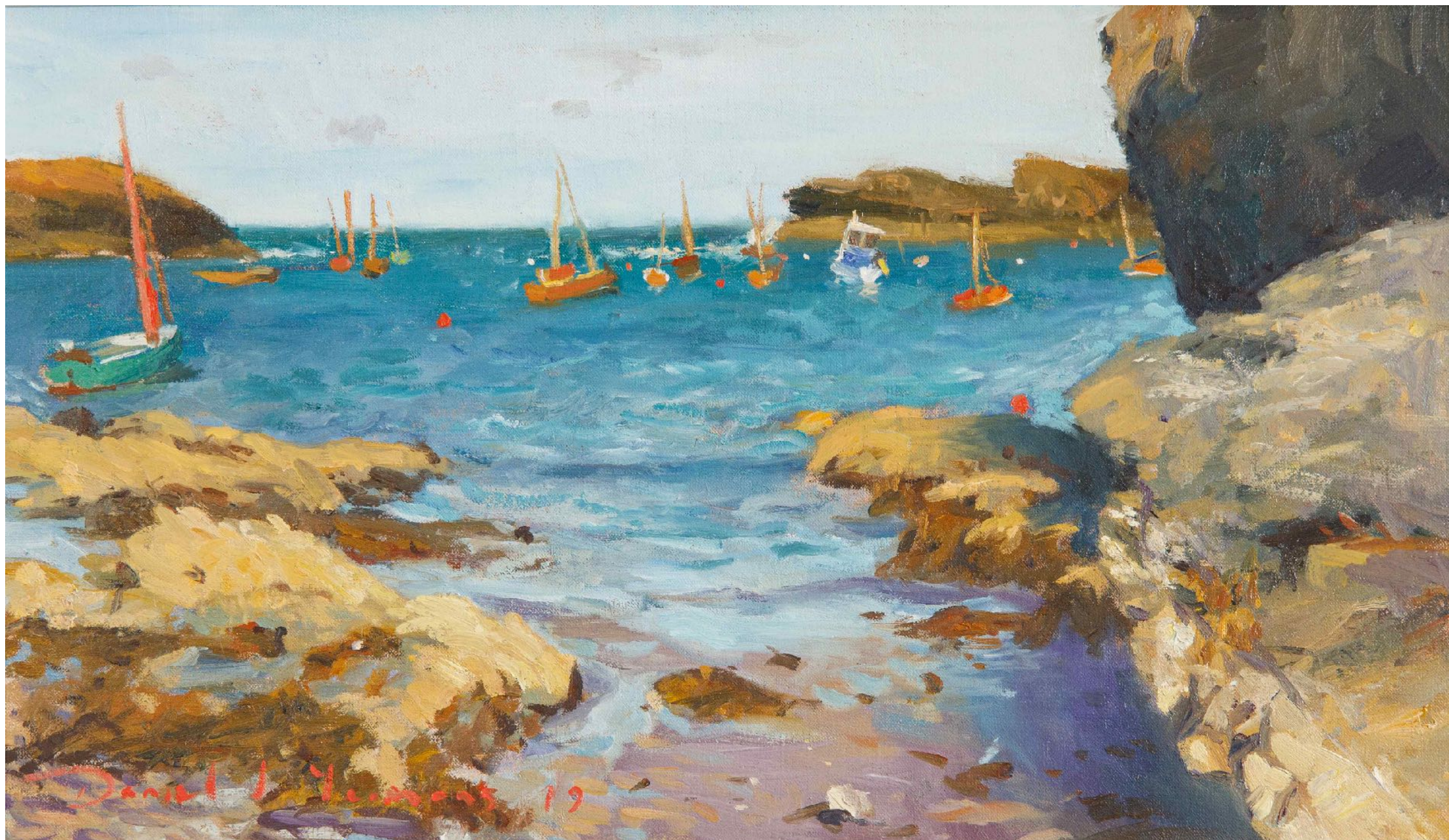
Awaiting the Regatta | 60x35cm | Oil on canvas)