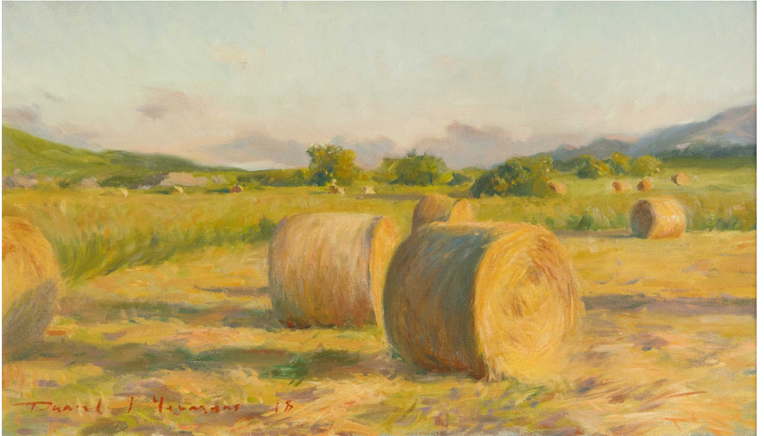
Hay bales at the foot of Snowdon | 60x35cm | Oil on canvas