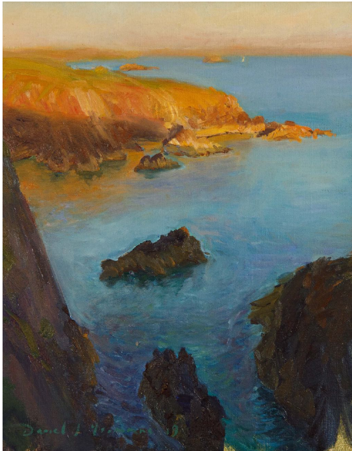
Autumnal Equinox - Porthclais | Oil on canvas | 40x60cm