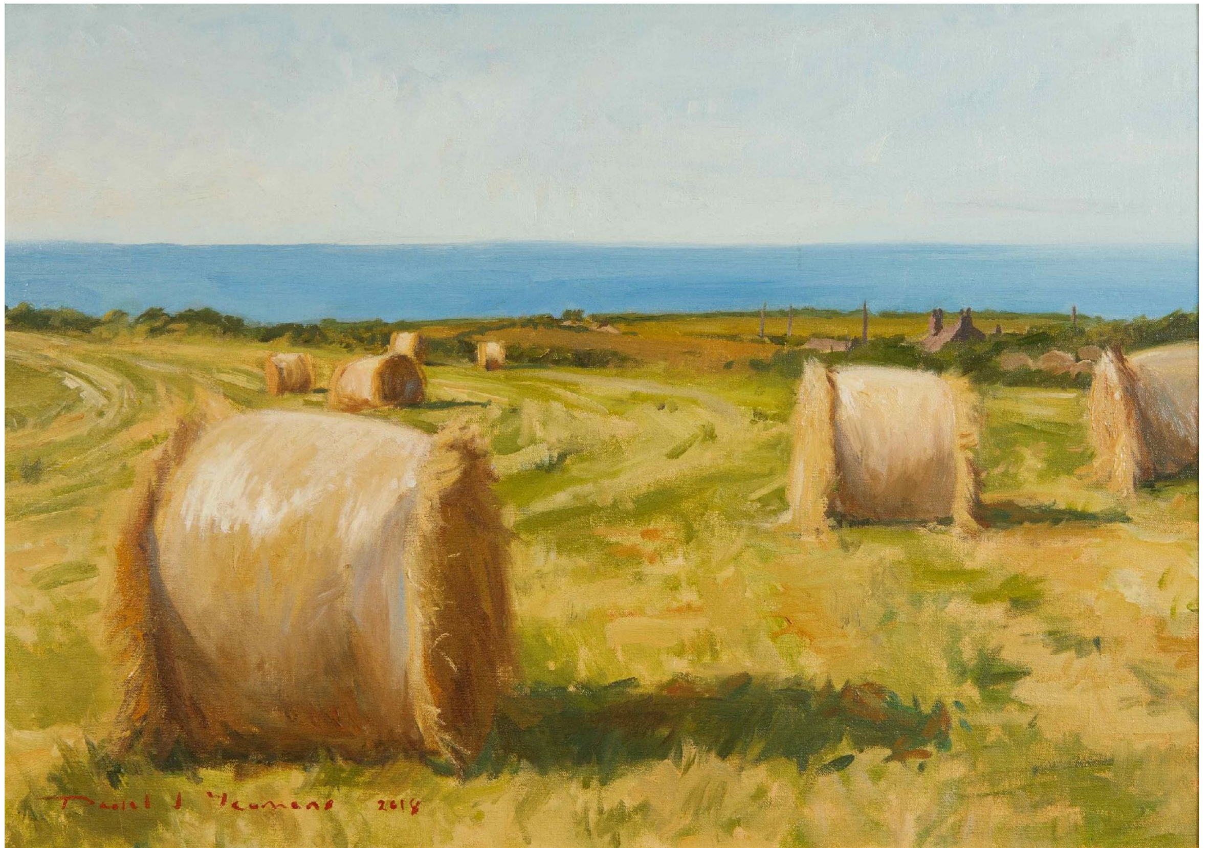
Hay bales bay the Irish Sea | 75x50cm | Oil on canvas