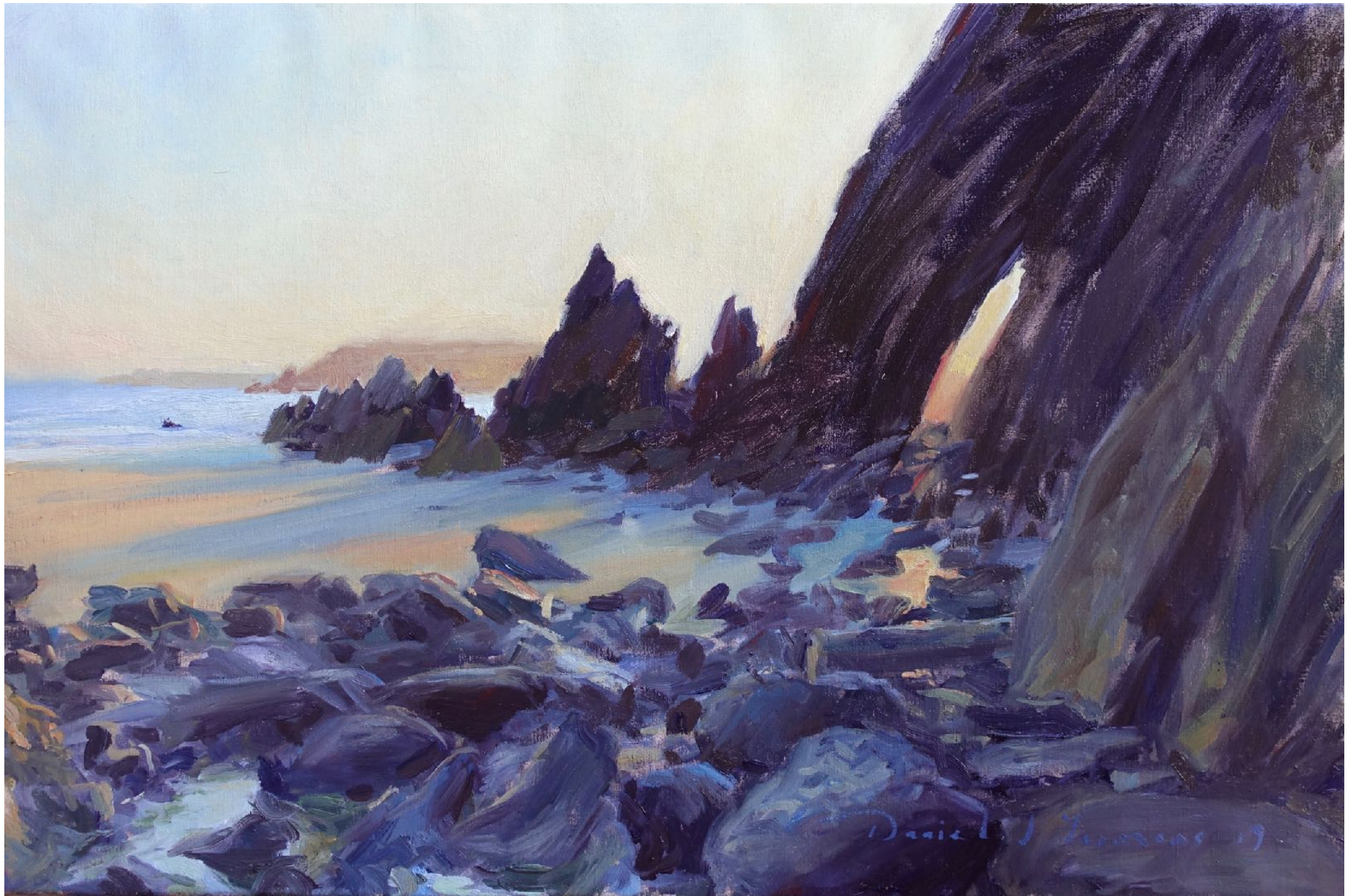
Marloes with evening sun effect | 75x50cm | Oil on canvas