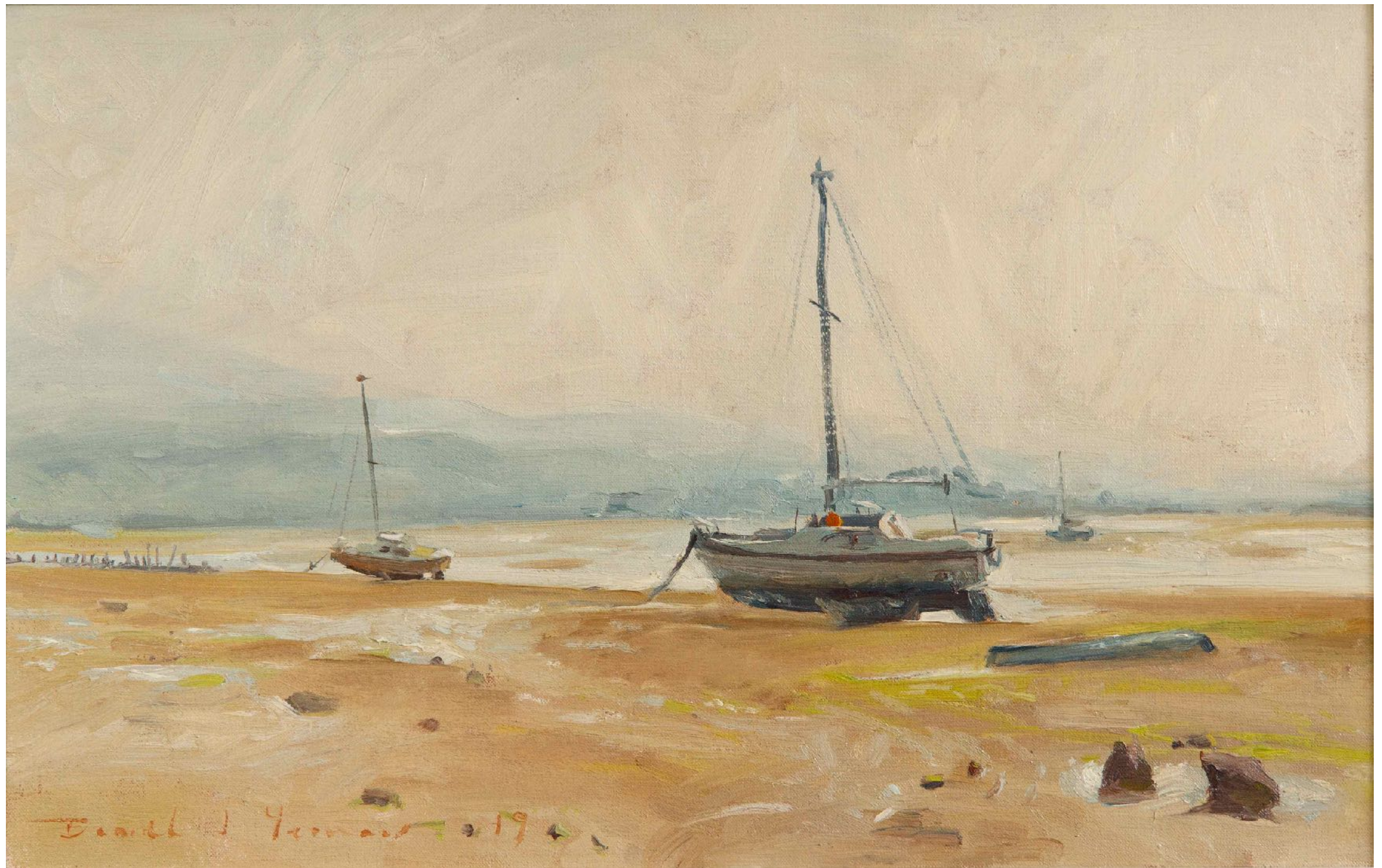
Boats in the Mist | Oil on canvas | 55x35cm