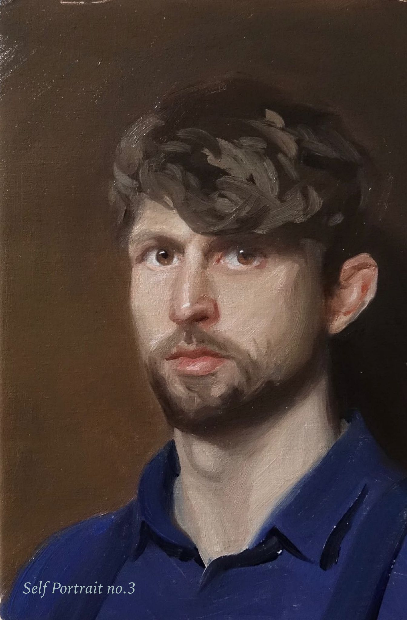
Self Portrait no.3