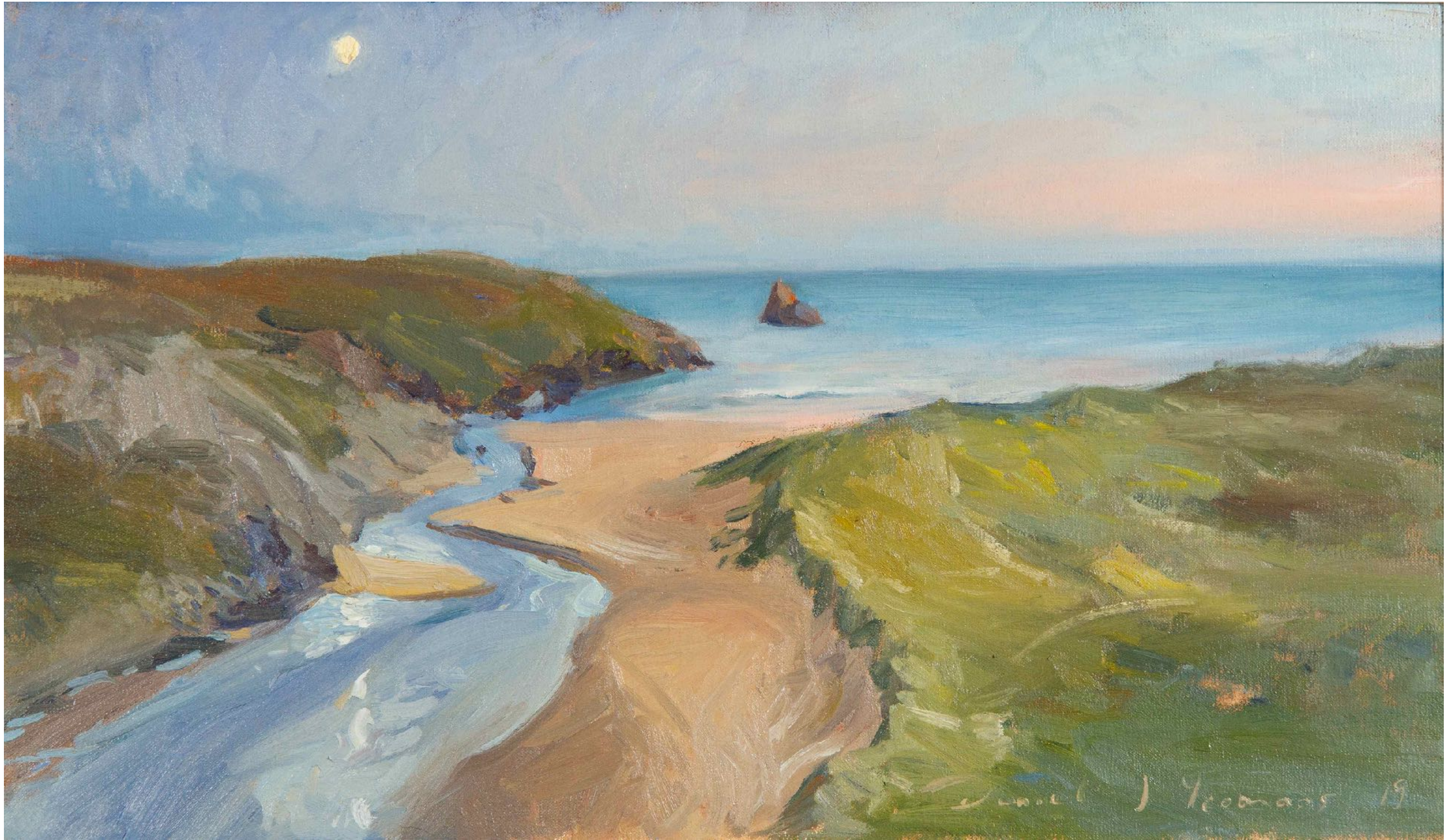
Moonlight on the Estuary | 35x60cm | Oil on canvas)