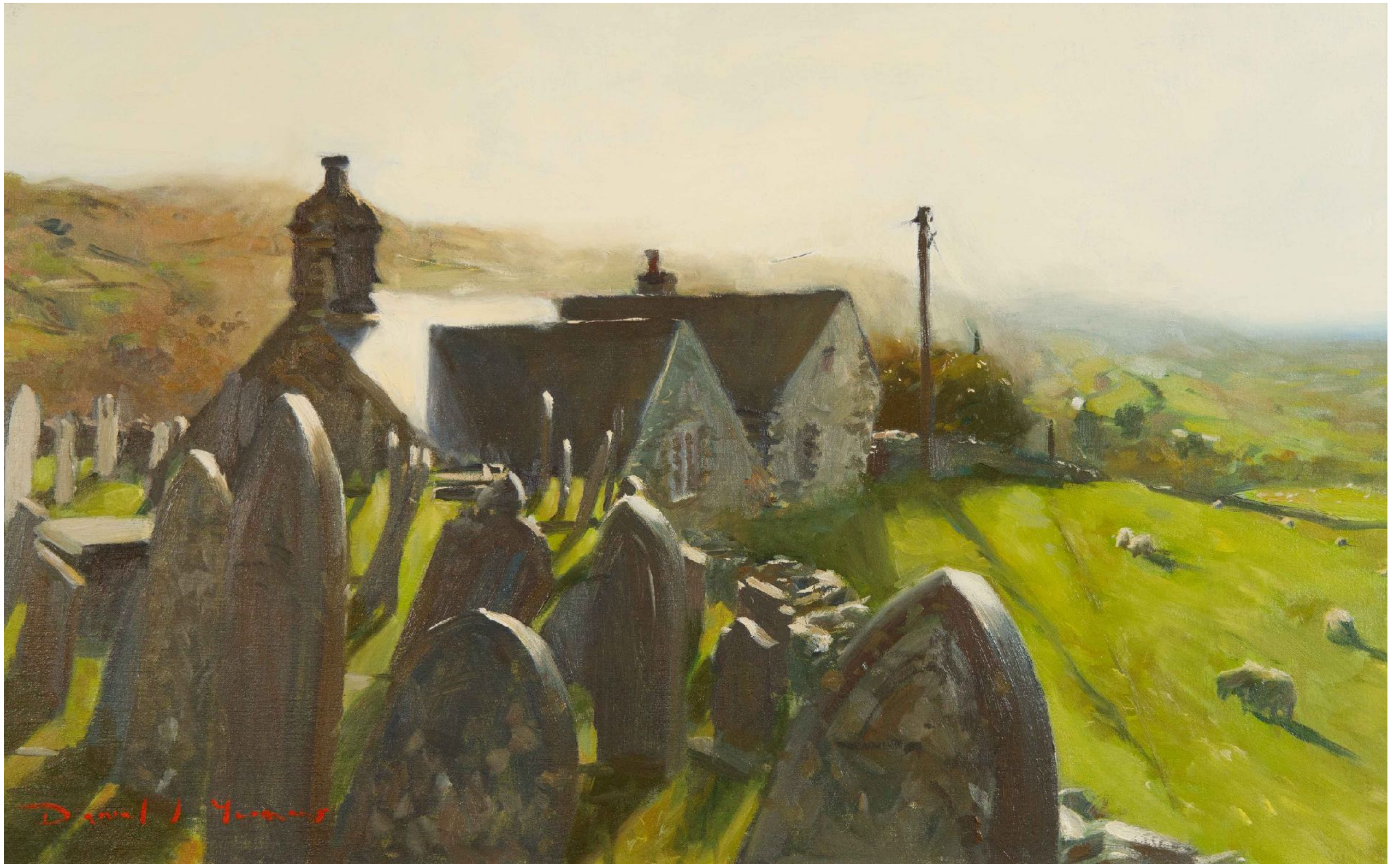
The Old Vicarage | oil on canvas | 80x50cm